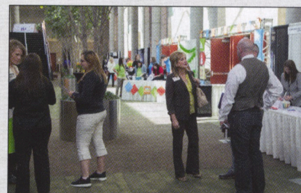
Booths and businesses spilled out into the halls at the Springfield Expo Center.